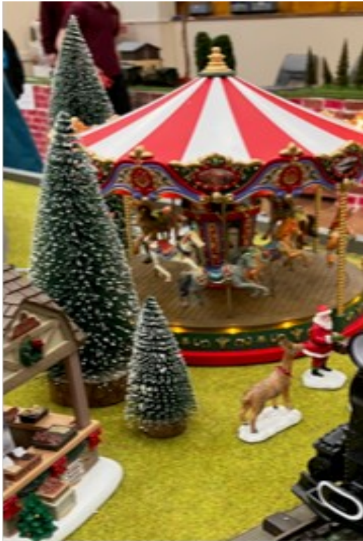
Wayne's Christmas fayre scene carousel