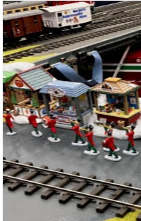
Marching band with music